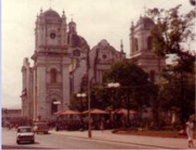
Photo of Roman Catholic Cathedral Known as the industrial capital of Honduras, San Pedro Sula's population is estimated about one million. It is a dynamic and bustling city with a modern airport served by Delta, American, Continental and Taca airlines.

Extraordinary attractions a short distance from the city include the Copan Mayan Ruins, beautiful beaches on the Caribbean, and the exotic Lake Yojoa in the mountains. You can reach one of the best coral reefs for scuba and snorkeling at Roatan and other Bay Islands in less than an hour by air.